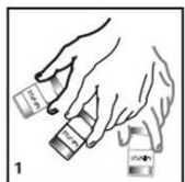
Figure 1 Gently shake the vial of DTaP-IPV component.

Pentacel: Instructions for Reconstitution of ActHIB Vaccine Component with DTaP-IPV Component